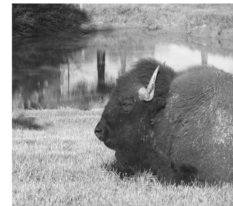
Elk & Bison Prairie 34Miles | 45 Minutes from Piney