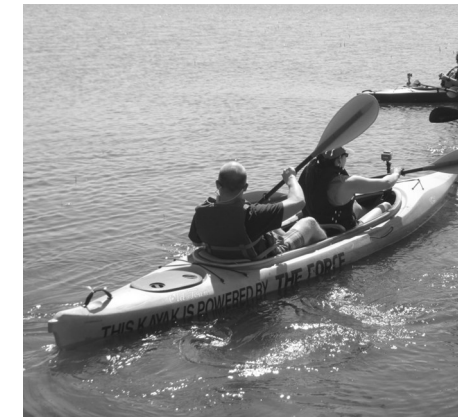
Brandon Spring Group Camp 12 Miles | 23 Minutes from Piney reservations required

Weather: Inclement weather, such as thunderstorms, excessively high winds, ice/snow, etc. can occur with little to no notice. When these events are predicted/occur take appropriate precautions, such as closing awnings, securing loose items around your campsite, take down/stake sunshades, etc. Contact Gatehouse for guidance about weather events.