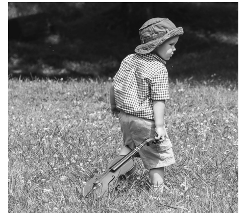
Homeplace 1850s Working Farm 19 Miles | 31 Minutes from Piney