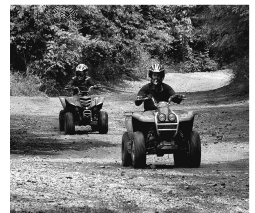
Turkey Bay Off-Highway Vehicle Area 29 Miles | 42 Minutes from Piney