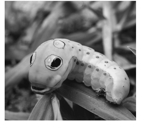
Woodlands Nature Station 43 Miles | 59 Minutes from Piney