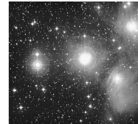
Golden Pond Planetarium and Observatory 31 Miles | 45 Minutes from Piney